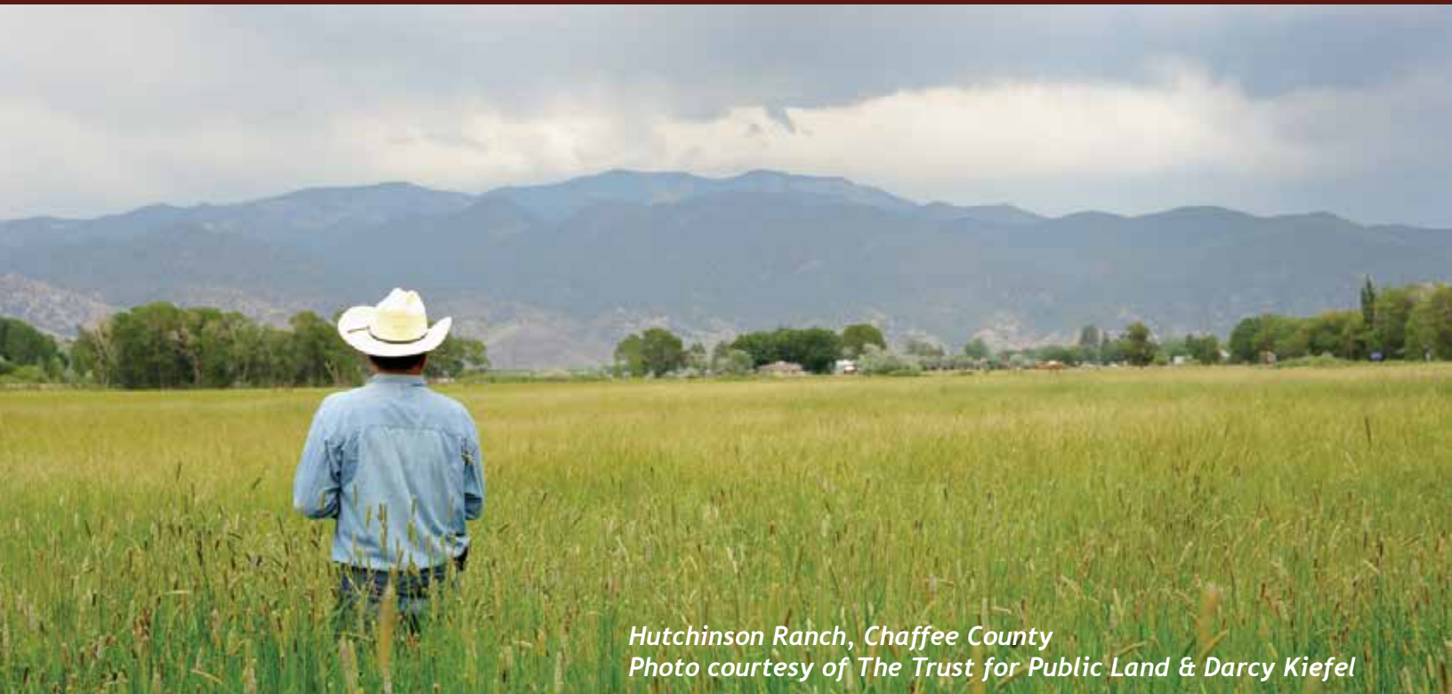
Hutchinson Ranch, Chaffee County