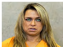
Denver residents are 'shocked' by controversial new site