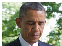
New currency law went into effect July 1st, 2014. [Devastating]