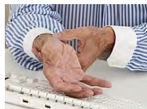
Studies indicate secret ingredients help reduce Neuropathy nerve pain.