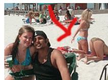
69 Perfectly Timed Photos That Are So Flawless It's Unreal...