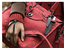
Exclusive: Coach Handbags selling for as low as $80. Limited