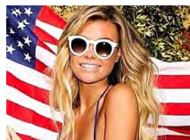
Top 20 Pics of the Hottest SI Swimsuit Models of 2015