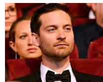
25 Celebrities Who Are Surprisingly Loaded