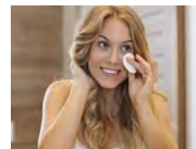
11 Benefits Of Apple Cider That May Surprise You...