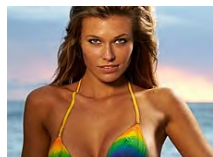
These smoking hot body paint pictures have readers asking,