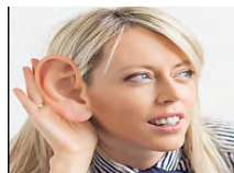
How to RESTORE your hearing WITHOUT hearing aids. Discover