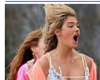
This Is What Happens When You Have Big Accessories!