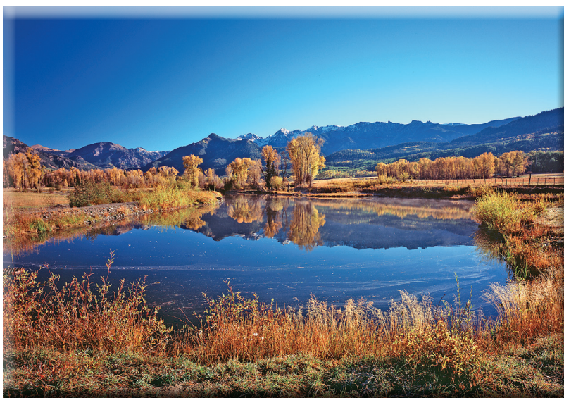
El Rancho Pinoso, Archuleta County

There is a special mystique about southwest Colorado. It is a hidden gem that can be enjoyed from the scenic vistas in the San Juan Mountains to the working farms and ranches below. This part of the State should be explored and is an important part of our ranching and conservation legacy. In this "Spotlight on Colorado" we will explore many of the counties in this region of the State and our success in protecting forever the ranching landscapes of these special places.